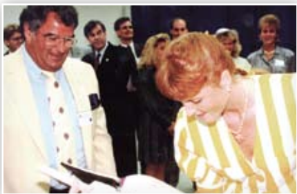
Dutchess of York