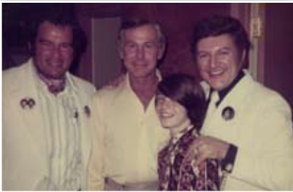
Carson, Liberace & René Simard