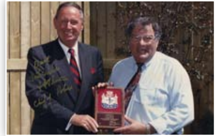
Chief of Police