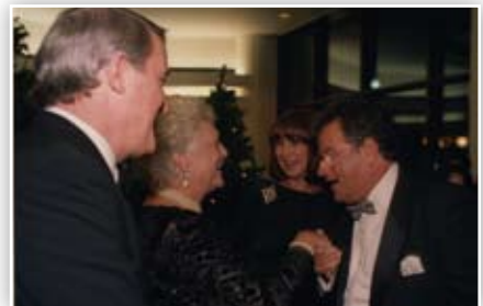
Brian Mulroney & Mrs. Bush